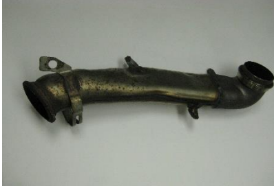
Stock Down Pipe Figure 6